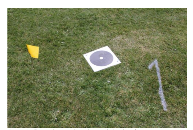
Figure 1: Ground control station and check point targets

The 9 ground control markers were theoretically positioned so that they were equidistantly distributed throughout the site to ensure an even distribution of errors.