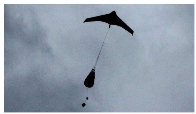
Figure 4: The C-Astral Bramor UAV during the initial deployment of its landing parachute.

As Surveyors we wanted to carry out our accuracy test in every day conditions which, by their very nature, are sub optimal. The prevailing weather conditions on the day of our flight test were cloudy with intermittent sunny spells with a wind speed at our flying altitude of 90m AGL was a maximum of 7m/s. The wind direction at altitude diverged from that used in our pre flight planning by 20 degrees. This had the effect on the UAV of getting a 10m/s variation in its ground speed when travelling with and against the wind.