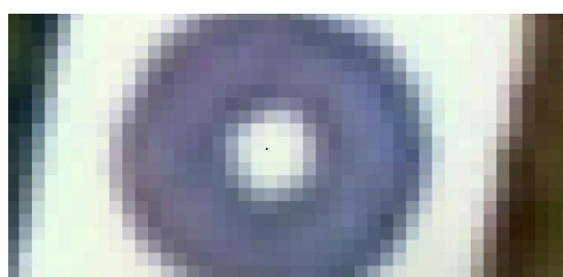
Figure 5: The targets as seen in the Orthomosaic. Note the black dot which represents where the centre of the target should be according to the Trimble GoeXR Network RTK GPS.

Firstly 10 control stations and 45 check points, which were surveyed by Network RTK GPS in Irenet95 coordinates, were downloaded into Geosite office 5.1 and exported to AutoCADlt 2013 as two separate files.