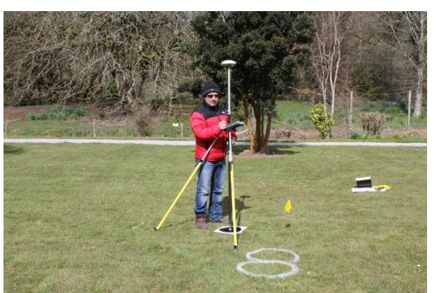
Figure 2: The stabilised Trimble GoeXR Network RTK GPS used to get the coordinates of the target centres.

The data acquisition system we used on this project is a hybrid of Trimble GoeXR Network RTK GPS and a C-Astral Bramor UAV. We used the RTK GPS to establish ITM coordinates on our specifically designed ground markers to provide photo control. The GPS unit has a spatial accuracy in the region of 10-25mm both horizontally and vertically, due to the fact that we used struts to maintain steadiness during NRTK readings.