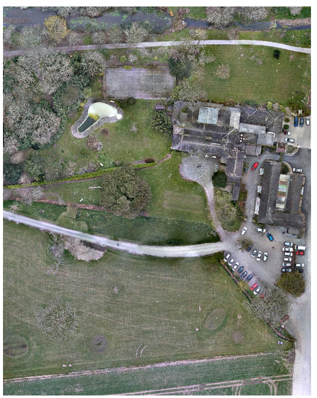
Figure 12: The outputted Orthomosaic.

This is the most spatially accurate aerial survey data that we could currently find anywhere on the internet.