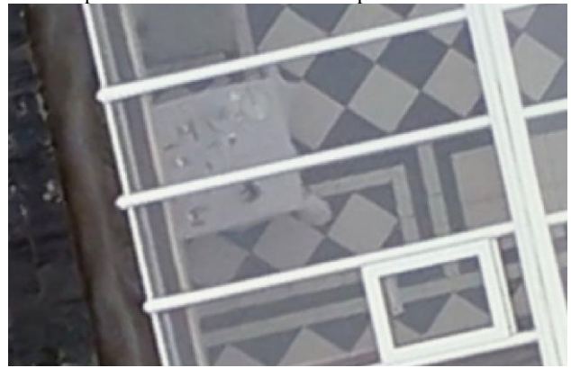
Figure 6: The detail of 1cm ortophotography can be seen here. This is a view looking down through the atrium over the dinning area of the surveyed hotel. Note the cutlery on the table.

Of the 728 photographs we then used 168 photographs to further process the data into a 3D model for subsequent orthophoto and DEM output. The orthophoto was outputted at a resolution of 10.2mm pixel size and the DEM was outputted at 20mm GSD.