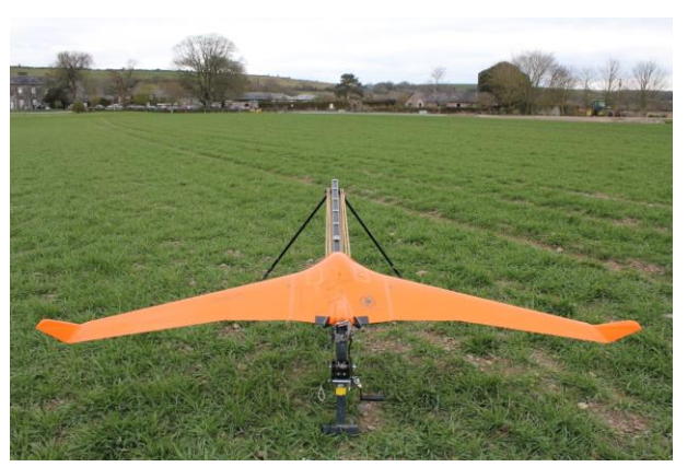
Figure 3: The C-Astral Bramor UAV on the catapult ready for launch.

is catapult launched, has extremely steady flight characteristics and advanced safety features afforded by its Lockheed Martin autopilot including a parachute deployment system for emergency and routine landing procedures. It carries a Sony Nex-7 24MP RGB sensor, which is oriented in portrait which allows for more forward overlap at a slower triggering interval. Our ground control markers were carefully designed so the most exact centre of the marker could be determined with a very high degree of accuracy from the photography at the processing stage.